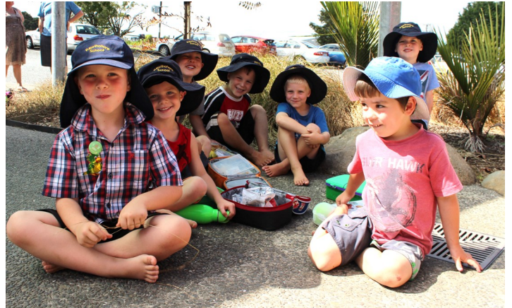
Kaurihohore School children sitting under their shade sails for lunch