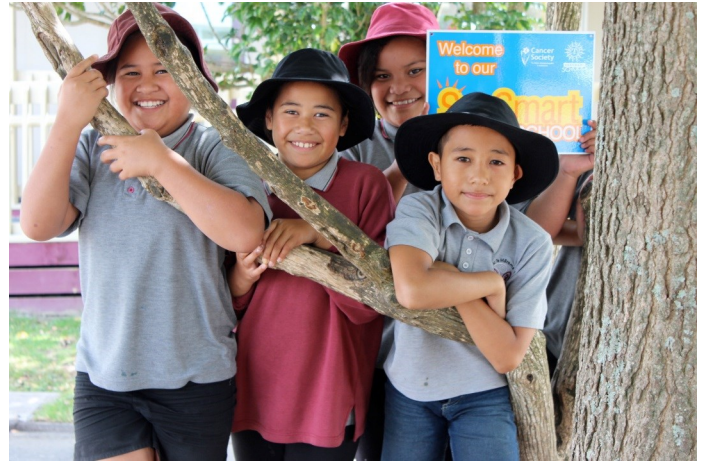
Wesley Primary School students in their SunSmart hats