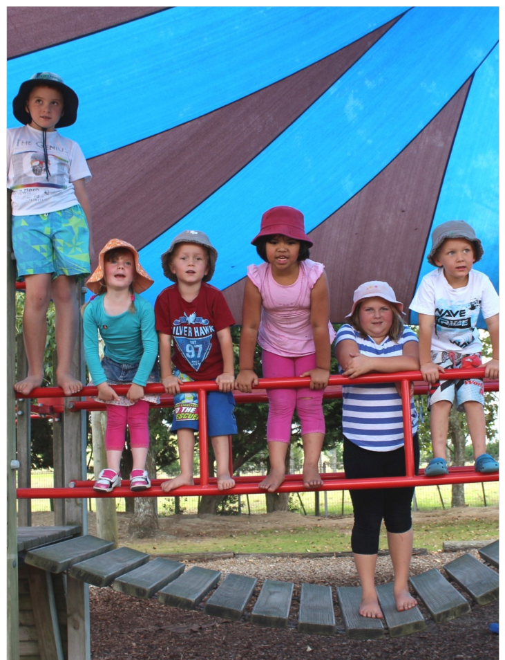
Ruakaka School children showing off their shade