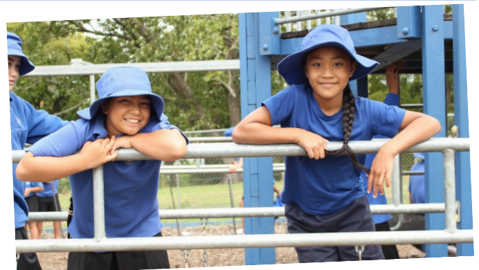
Glenbrae Primary School girls in their uniform hats