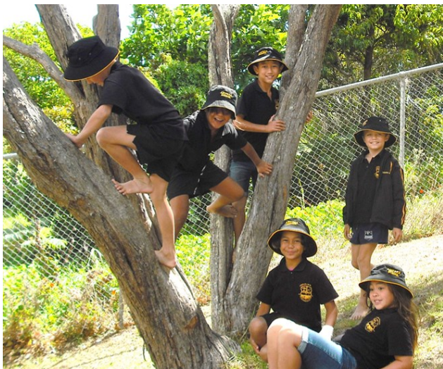
Fun in the shade: Ahipara Primary School children